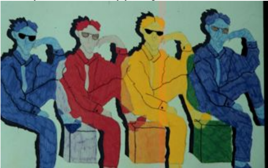
3. Gesture drawing in markers