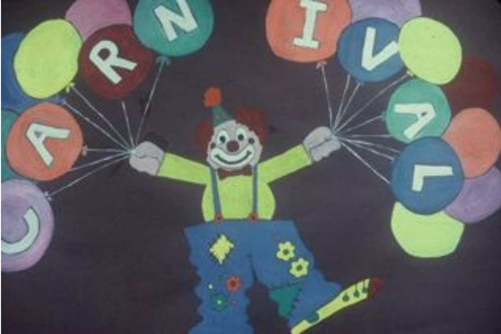
2. Clown painted on dark color of paper using tints of colors